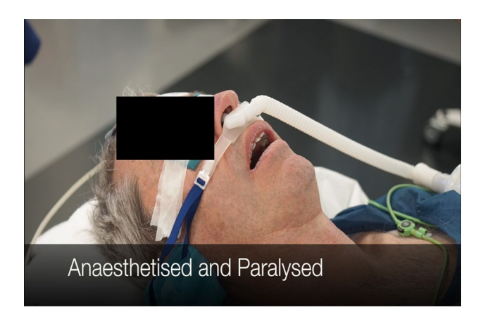
Fig. 2 Example of subject connected to THRIVE apparatus