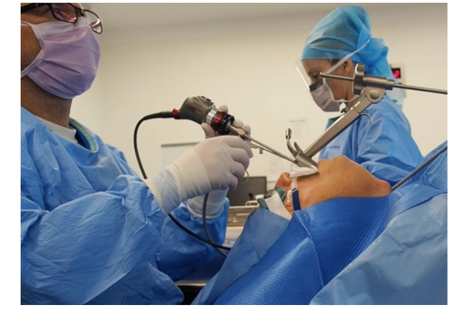
Fig. 3 Clinical photograph of apnoeic oxygenation using THRIVE during an elective microlaryngoscopy procedure

deadspace volume, and higher closing capacity, which results in faster onset to desaturation [56, 66–70]. The paediatric intensive care literature commonly describes flow rates of 1-2L/kg/min. Humphreys showed THRIVE prolonged apnoea time compared to jaw thrust alone prior to intubation [69]. Riva however showed THRIVE had no additive benefit in extending apnoeic window compared to LFNO [70]. Both studies failed to demonstrate effective CO<sub>2</sub> clearance in children, with similar rise in transcutaneous