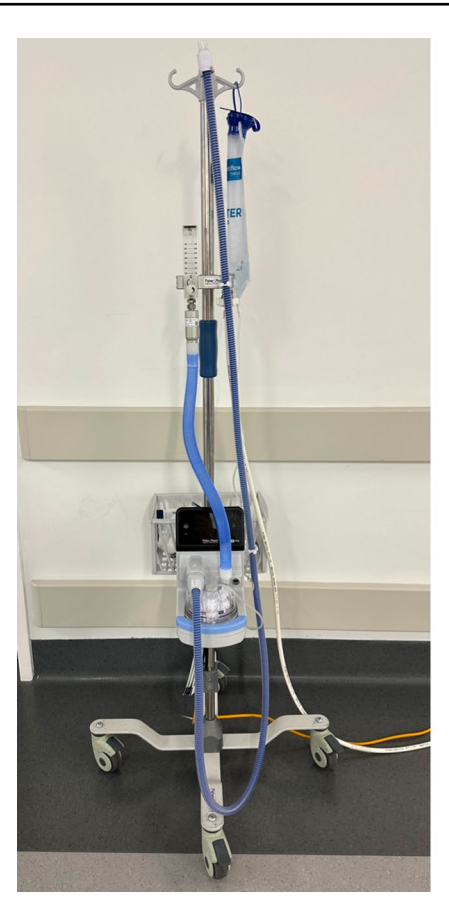
Fig. 1 The OptiFlow oxygen delivery system (left) and the wide-bore nasal cannulae used for trans-nasal high flow oxygen delivery during THRIVE (right)